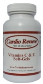
Cardio Renew C & E Soft-Gels